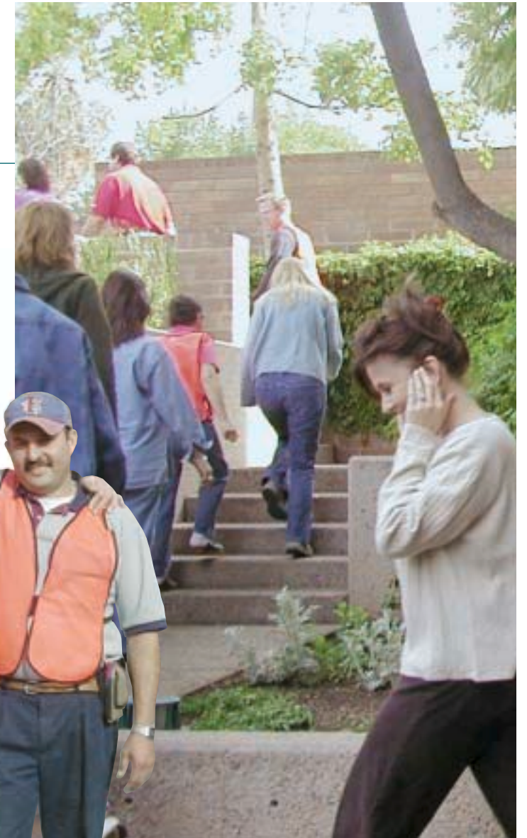
Above: Exiting the South building. Whoa, those sirens are loud! Below: The Fire Wardens successfully completed their rounds.