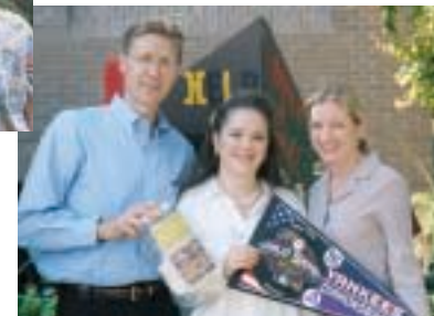
BOMA representatives are thrilled with the Brookstone's contribution to the Habitat for Humanity fund.