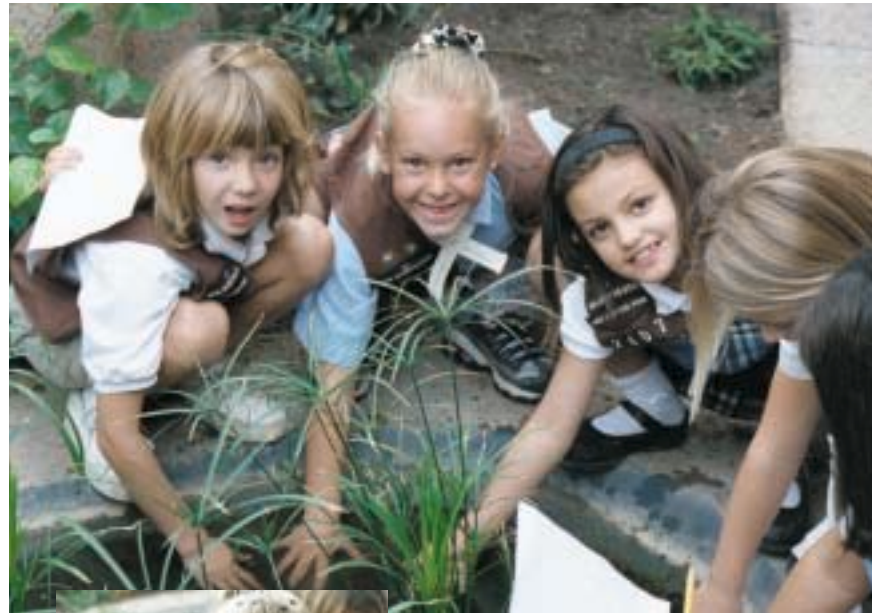
Above: Girls from Brownie Troop 2407 get their hands wet exploring the Brookstone Gardens.

Brookstone gardens provide learning opportunities for local kids